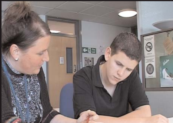
Video demonstrating how a specialist tutor works with a learner