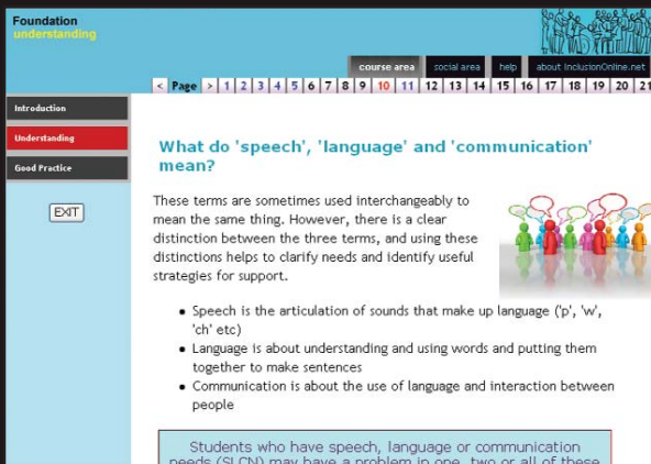
A page from the SLCN course